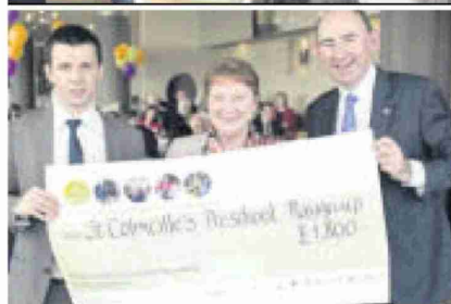
VERY GRATEFUL: St Colmcille's Playgroup and NIKPA