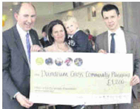
WORTHY RECIPIENTS: Local charities Speedwell Trust and Dundrum Cross Community Playgroup are awarded cheques